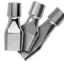
PROFEMUR® Modular Neck Technology