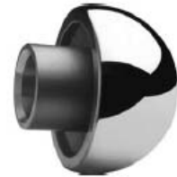
CONSERVE® TOTAL BFH® Head